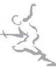
Tableau of 128