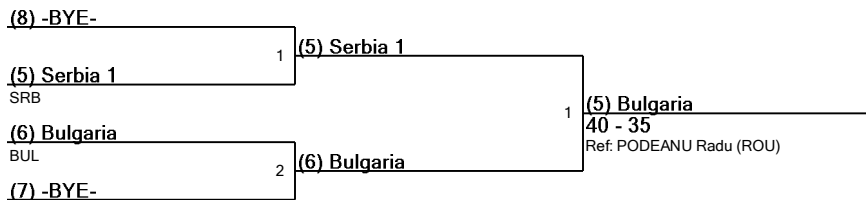
Table of 2 (Pl. 5-6)